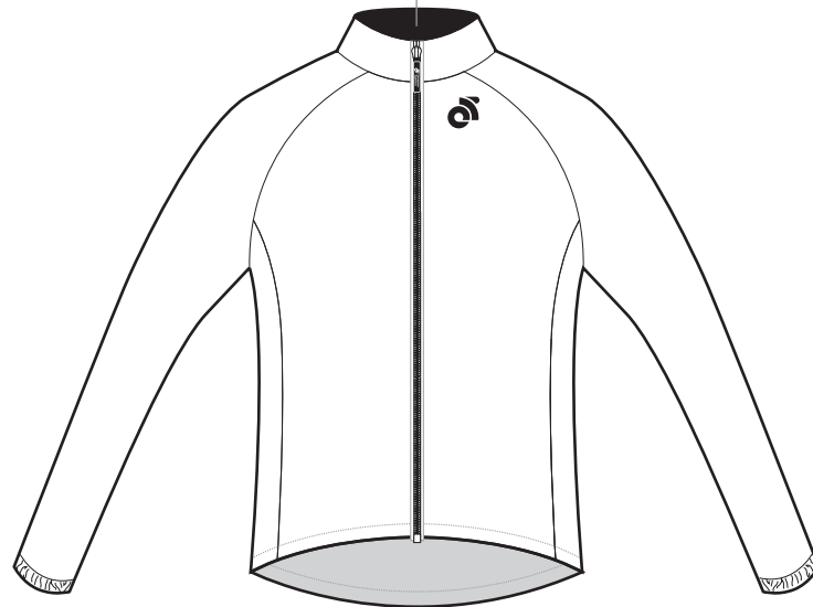
: Repel Jacket (RKJ015) : ( Full Printing ) ( Fleece Fabric inside Collar )