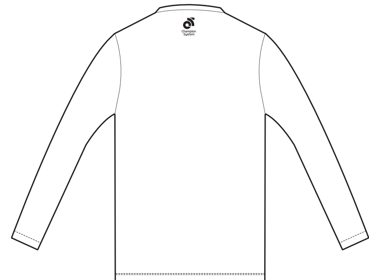
: Back View :