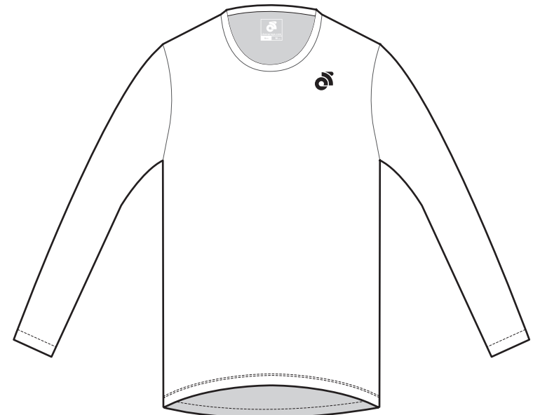
: Front View :