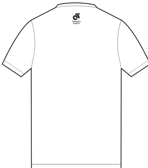
: Back View :